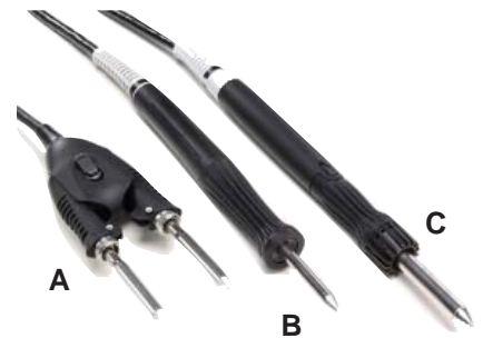
MFR-2200 Series Hand-pieces A. MFR-H4-TW Precision Tweezers B. MFR-H2-ST Soldering Tip C. MFR-H1-SC Soldering Cartridge