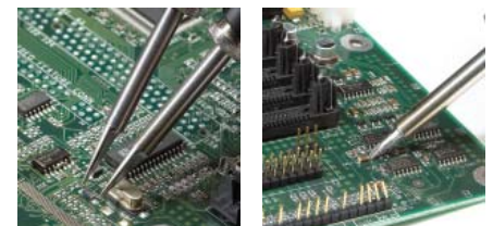
Precision Tweezers rework SMD components with fine dimension to large blade geometries, while the Soldering Tip hand-piece has exceptional power for production soldering.