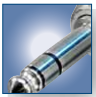
3 pole plug