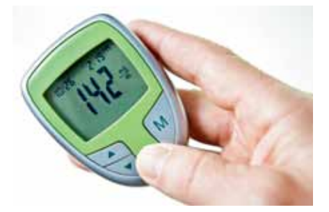
Fig. 3: Blood glucose meter

When it comes to safety technology, a short and precisely defined reaction time in the event of faults is important along with reliability across a wide temperature range. Both requirements have to be assured during the device's overall service life. Furthermore, the typical design parameters of standalone devices must be considered: The focus here is on low power consumption, small form factor and an attractive price/performance ratio. In addition, there are further desirable characteristics such as those relating to recycling.