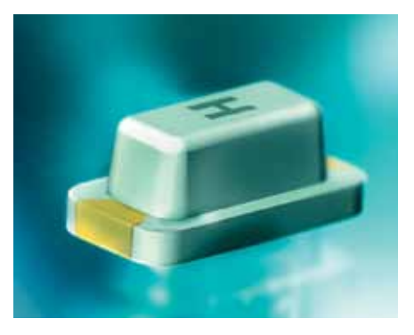
Fig. 4: USF 0402 super-quick-acting SMD fuse, 1.05 \times 0.55 mm, with rated currents from 375 mA to 5 A.

Both fuses have been developed for the overcurrent protection of secondary circuits. The rated currents for the USF 0402 range from 375 mA to 5 A, while it has a rated voltage of 32 VDC up to 4 A and 24 VDC up to 5 A. The breaking capacity is specified at 35 A at rated voltage. The USFF 1206 was developed for smaller rated currents of from 50 to 250 mA; its rated voltage is 63 VDC and its breaking capacity is 100 A.