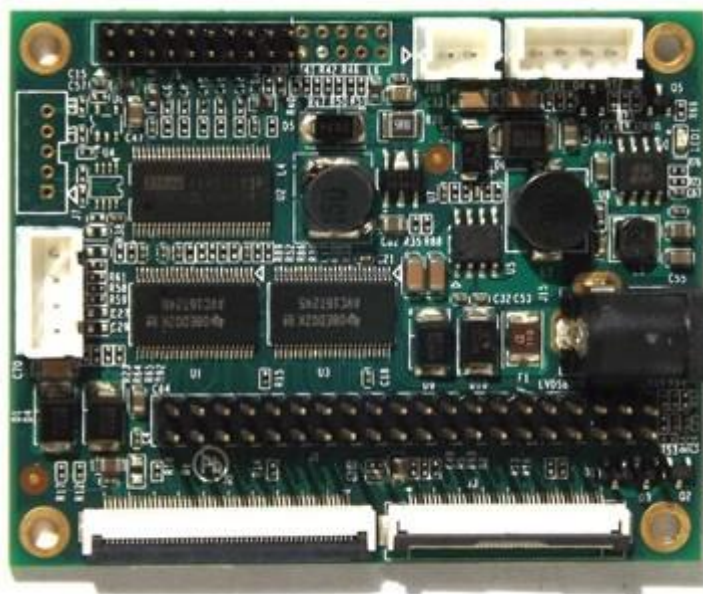
LVDS8000 Adapter Board

Embest has recommended one LVDS LCD and Touch Screen for working with DevKit8600 board.