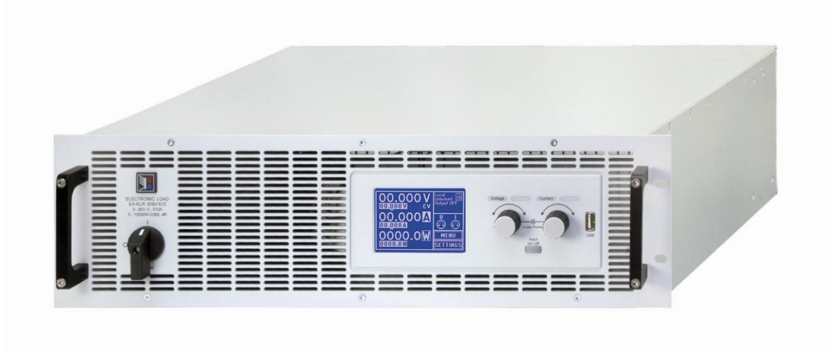
EA-ELR 9080-510 19" 3U, 0-80V, 0-510A, 0-10,5kW