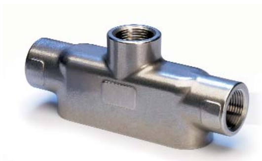
TB Outlet Body