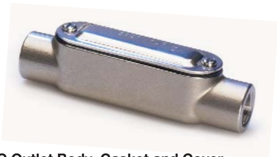
C Outlet Body, Gasket and Cover