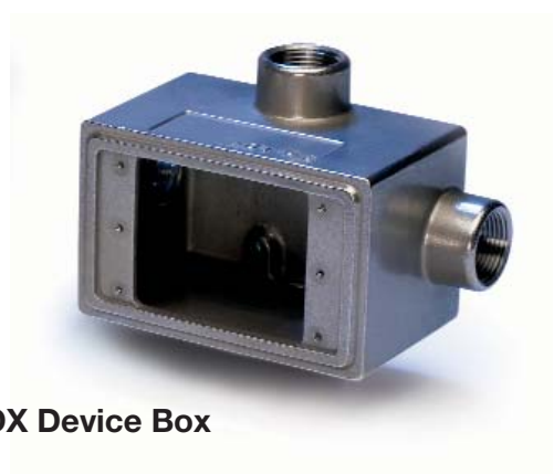
FDX Device Box