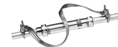
XJG shown with optional bonding jumper