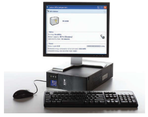
The 5S fits in small spaces and can also be used as a monitor stand.