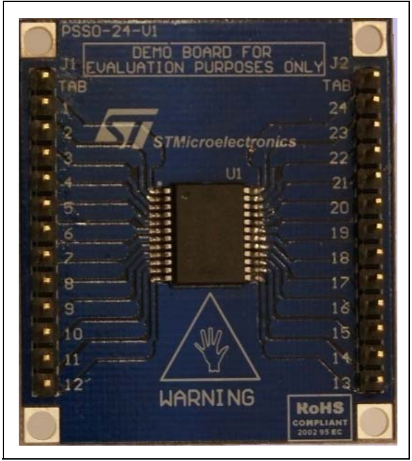
Figure 1. VNQ5E160K evaluation board

The diagnostic feedback of the whole device can be disabled by pulling the STAT_DIS pin up, thus allowing wired-ORing with similar devices.