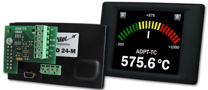
SGD 24-M not included

This add-on module interfaces directly with any PanelPilot-compatible display. It has built-in cold-junction compensation (CJC) and takes it's power directly from the SGD meter.