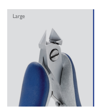
Tungsten Carbide Tapered Sharp Tip Full Flush Diagonal Cutter