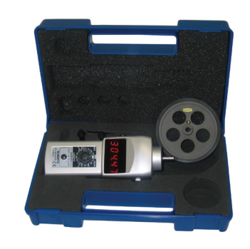
DT-107A-S12 shown in carrying case, with 12" circumference wheel