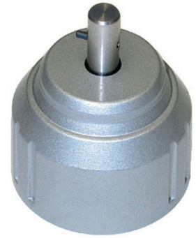
DT-ADP-200L Contact adapters for DT-205L and DT-207L Laser tachometers.