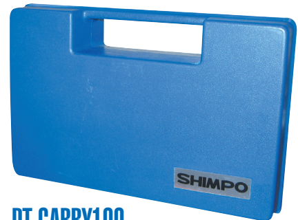
DT-CARRY100 Plastic carrying case for all DT series handheld tachometers.