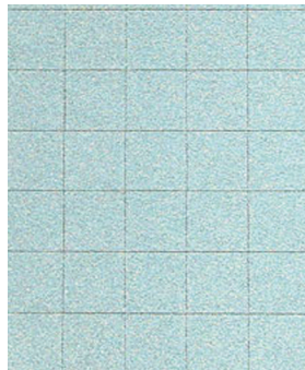
Reflective Tab - 1/2" x 1/2" 35 tabs per sheet. Tab