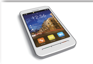
1 Smart Phone