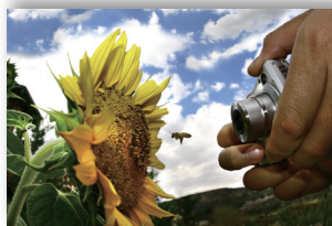
2 Digital Camera