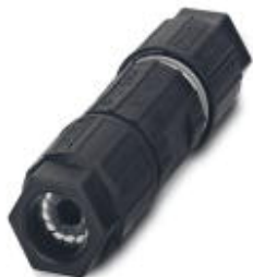
QUICKON conductor connector, 4-pos., connection cross section 0.14-0.34 mm 2

Please be informed that the data shown in this PDF Document is generated from our Online Catalog. Please find the complete data in the user's documentation. Our General Terms of Use for Downloads are valid ( http://phoenixcontact.com/download )