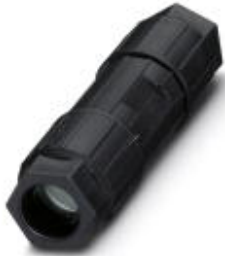
QUICKON conductor connector, 4-pos., connection cross section 0.34-0.75 mm 2

Please be informed that the data shown in this PDF Document is generated from our Online Catalog. Please find the complete data in the user's documentation. Our General Terms of Use for Downloads are valid ( http://phoenixcontact.com/download )