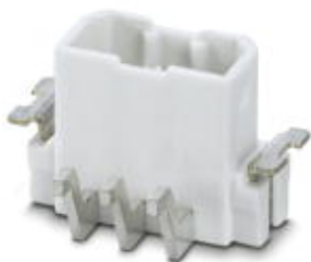
Header, Nominal current: 6 A, Rated voltage (III/2): 160 V, Pitch: 2.5 mm, Color: white, Assembly: Taped SMD/THT/THR components

Please be informed that the data shown in this PDF Document is generated from our Online Catalog. Please find the complete data in the user's documentation. Our General Terms of Use for Downloads are valid ( http://phoenixcontact.com/download )