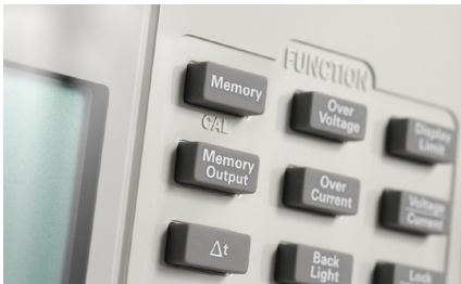
Figure 1. Output sequencing made easy with intuitive keypads

Both models of the U8030 series come with a set of features to suit your needs while remaining easy to use. The LCD screen displays both voltage and current readings in a one-view panel while the all ON/OFF button allows multiple outputs to be controlled simultaneously. Additionally, the auto-track feature simplifies setup between output 1 and output 2. With these, you get a solid bench power supply plus a set of convenient and easy to use features.