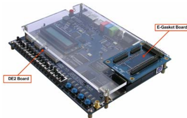
Figure below shows the connection of E-Gasket with DE2 board.

For more information on E-Gasket Snap On board, visit http://www.slscorp.com/products/santacruz-snap-on-board/e-gasket.html