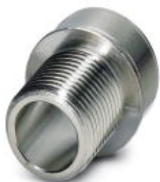
M12 pin, housing screw connection, press-in version, for all Speedcon-compatible THR and wave soldering contact carriers

Please be informed that the data shown in this PDF Document is generated from our Online Catalog. Please find the complete data in the user's documentation. Our General Terms of Use for Downloads are valid ( http://phoenixcontact.com/download )