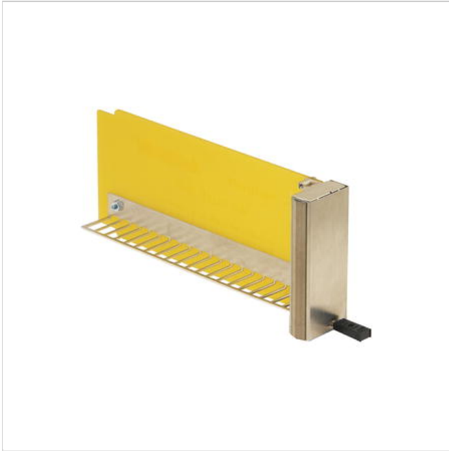
Filler module, single, full-size with air baffle