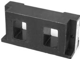
A200 ac Coil, 120/110 V 60/50 Hz, 2-, 3-, 4-Pole, Sizes 00, 0 and 1