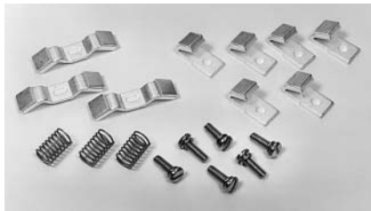
Contact Kit for A200 Model J, Size 2-, 3-Pole