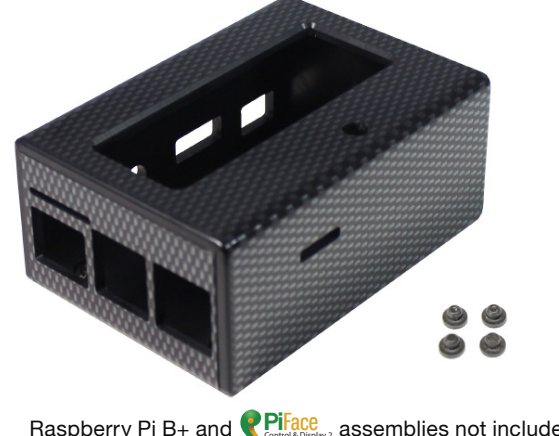
Raspberry Pi B+ and Picace assemblies not included