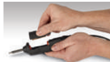
Collection chamber replacement