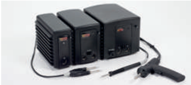
MFR-2200, MFR-1100 and MFR-1300 series (shown on page 14)