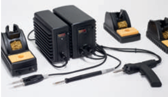
MFR-2200 and MFR-1100 series