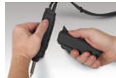
Remove grip for Pencil config.