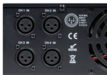
SL 4120 Rear