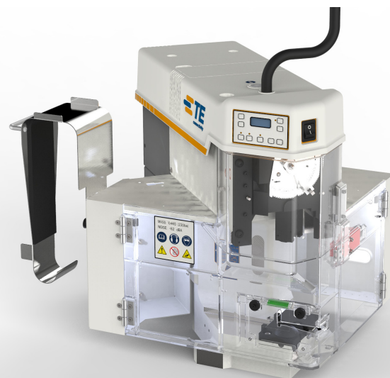
Wire Processing for Crimp Terminals

Designed for the ultimate in flexibility, reliability, and safety.