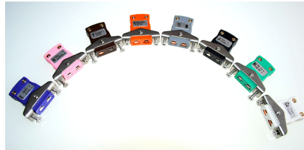
'Stainless steel panel mounting bracket'