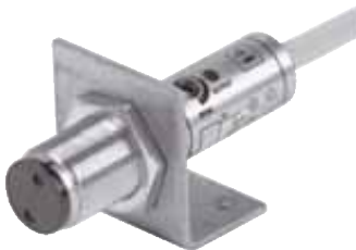
Sensor fitted inside the mounting aid

Using the mounting aid cylindrical sensors are fast and easy to fit. Use the nuts included with the sensor for attachment.