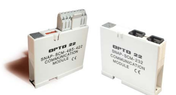
SNAP Serial Communication Modules

Both SNAP serial communication modules work with SNAP PAC Ethernet-based brains and rack-mounted controllers, both standard wired models and Wired+Wireless<sup>™</sup> models. (They do not work with serial-based SNAP PAC brains.) These modules snap into Opto 22 SNAP PAC mounting racks right