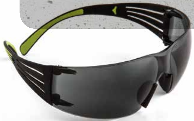
3M™ SecureFit™ Protective Eyewear, 400 Series

The original 3M™ SecureFit™ Protective Eyewear, 200 Series featured the proprietary self-adjusting 3M™ Pressure Diffusion Temple Technology – a scientific advancement that helps diffuse pressure over the ear, enhancing frame temple comfort while not compromising the security of fit. But the innovation doesn't stop there – Introducing 3M™ SecureFit™ Protective Eyewear, 400 Series.