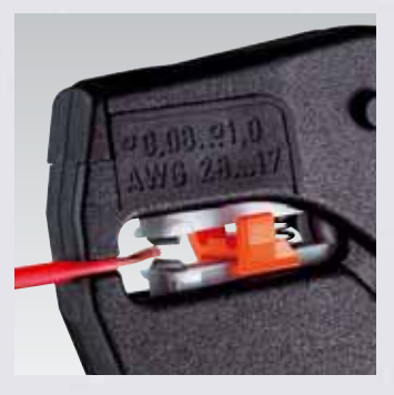
Adjusts automatically to the respective cable cross-section from 0.08 – 1.0 mm<sup>2</sup>