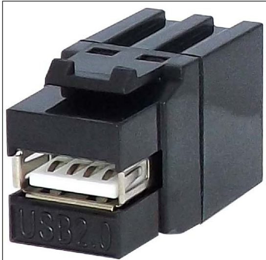
USB2 A to A keystone coupler (KCUAA2bk)

This USB2 keystone coupler can be used as a link between e. g. a USB cables. With its standardised dimensions it can be used for easy snap-in mounting in a keystone patch panel, face plate or surface-mount box.