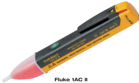
Fluke 1AC II