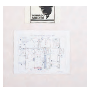
Laminator allows you to laminate one side of document while applying adhesive to reverse.