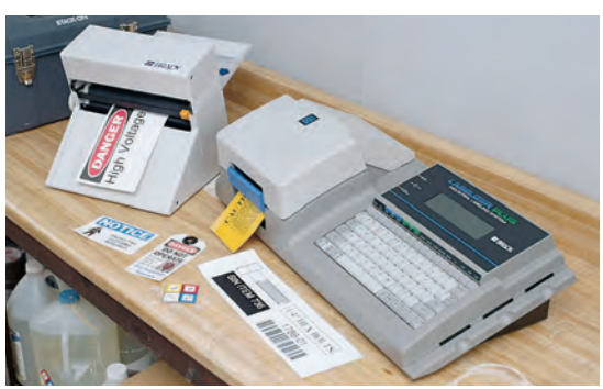
Provides the perfect finishing touch for your Brady printer.