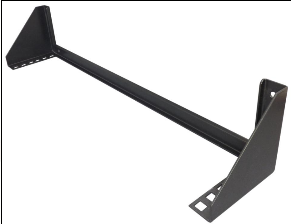
2U Wall Mount Bracket (MCMpan)

The 2U 19" wall mount equipment rack bracket offers a versatile storage solution for telephone systems, network devices, power strips and patch panels to be mounted vertically (flush with wall) to save space. Alternatively, the 2U bracket can be installed horizontally under a desk or shelf, making it easy to access installed equipment directly from your workspace.