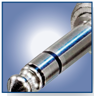
3 pole plug