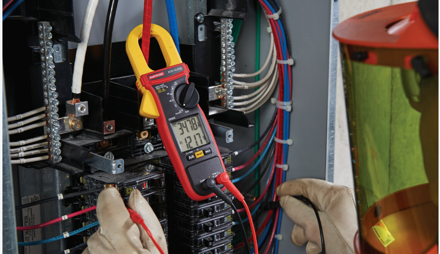
The Amprobe ACD-14-PRO can test and display voltage and current measurements simultaneously with the large backlit LCD dual display, for voltage drop tests and other applications.

Voltage drop test - dual display allows user to view voltage and current simultaneously to assess voltage drop for current changing from zero to a maximum value.