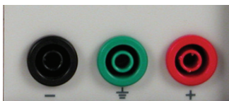
The 9120 series uses 4mm sheathed banana jacks that accept sheathed or shrouded banana plugs and meet the latest international safety standards.

Standard Accessories: User manual, power line cord, IT-E131 RS232 to TTL serial converter cable, IT-E132 USB to TTL serial converter cable, and software installation disk. Model 9123A also includes IT-E135 GPIB to TTL conversion adapter cable. Optional Accessories: IT-E151 rack mount kit.