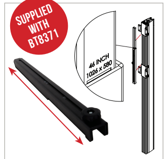
Screen spacer designed to eliminate calculations and guess work when installing horizontal rails