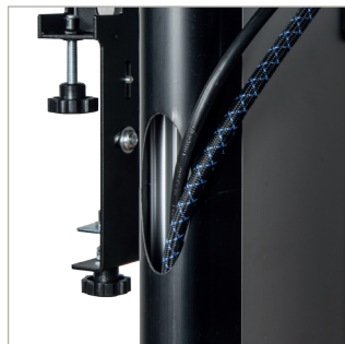
Cable management covers hide untidy cables and add to the stylish finish