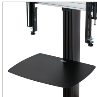
Fit System 2 compatible accessories such as shelves without using collars