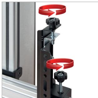
8 point tool-less micro-adjustment for seamless screen alignment