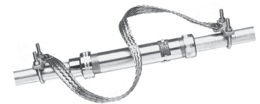
XJG Shown with Optional Bonding Jumper

Bonding jumper width: 0.188"; height: 0.875"