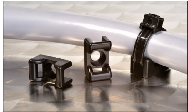
Cable Tie Mounts KR6G5, KR8G5 and CTM.