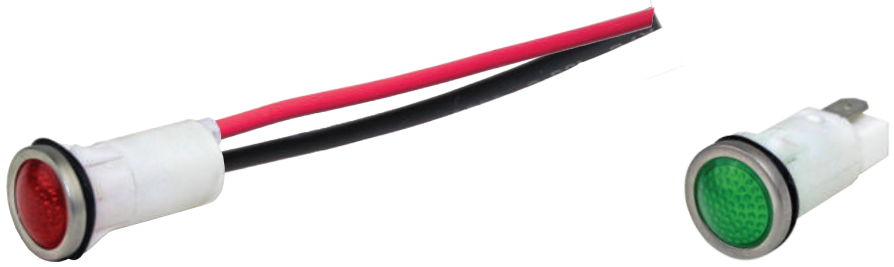
Examples: SPC472 in Panel Mount Indicators