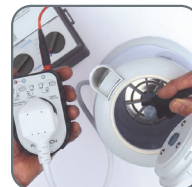
Class I earth bond