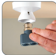
Plug in Lightmate