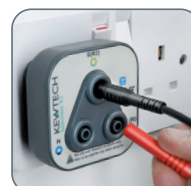
For ring mains testing