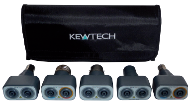
Lightmats (BC, ES, GU10, SBC & SES)