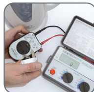
Class II insulation