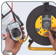
Extension lead testing