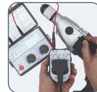
Class I insulation