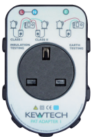
PAT Adaptor 1