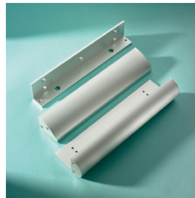
AMH590/ZA Architectural Z&L brackets