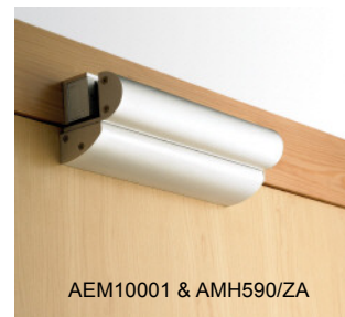
AEM10001 & AMH590/ZA

Note: Double Magnets will require 2 brackets