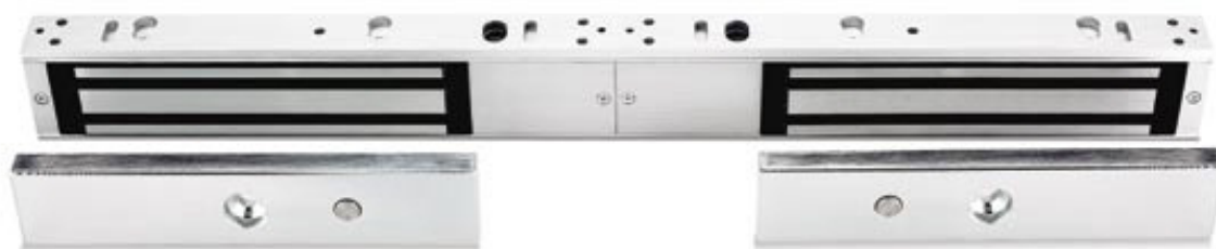
Slimline double magnet - AEM10003

*Please note, the holding force of all electromagnetic locks is dependant on the specific installation details. Figures quoted are therefore nominal.