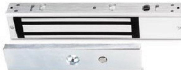
Slimline single magnet - AEM10001

*Please note, the holding force of all electromagnetic locks is dependant on the specific installation details. Figures quoted are therefore nominal.