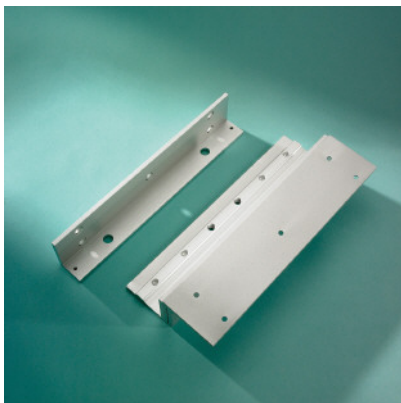
AEMBR089F Z&L brackets