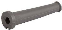
4804.0054 Sleeve brown, 4.2 mm