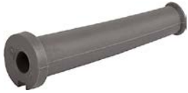
4804.0002 Sleeve brown, 5.6 mm