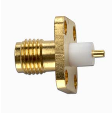
Model 72962 SMA JACK PANEL RECEPTACLE (4 HOLE)

High bandwidth, small size, and durability for confident connections