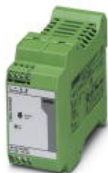
Primary-switched MINI POWER power supply for DIN rail mounting, input: 1-phase, output: 24 V DC/2 A

Please be informed that the data shown in this PDF Document is generated from our Online Catalog. Please find the complete data in the user's documentation. Our General Terms of Use for Downloads are valid ( http://phoenixcontact.com/download )