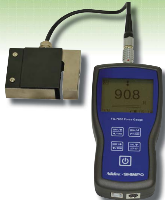
FG-7000L with Connected Load Cell