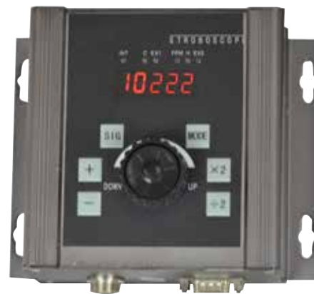
Remote Control Enclosure