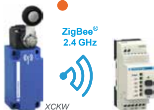
Wireless offer: one-way pulsed transmission

Wave generated automatically without a battery