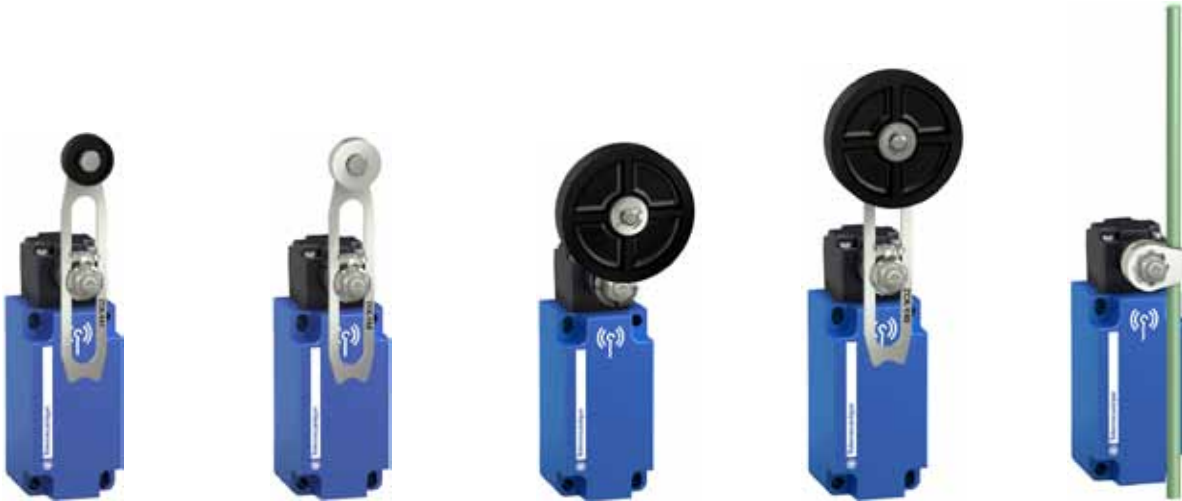
Variable length thermoplastic roller lever (1) Variable length steel roller lever (1) Elastomer roller lever, Ø 50 mm Variable length elastomer roller lever, Ø 50 mm (1) Round thermoplastic rod lever, Ø 6 mm (2)

ZigBee® Green Power at 2.4 GHz (IEEE 802.15.4)